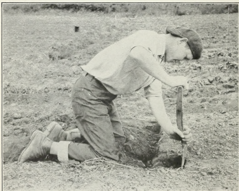
FIG. 2.—DIGGING BULBS

Note that there are no surface indications of the location of the bulbs